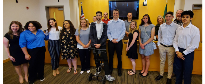
The Youth City Council presented for the first time to the Yelm City Council at last Tuesdays meeting.