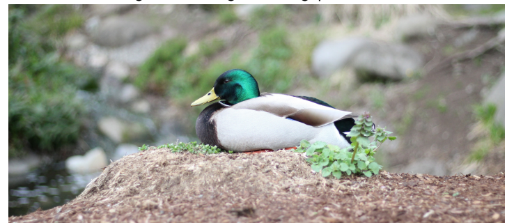
Ducks and other wildlife are prominent at Cochrane Memorial Park.

The engineering study will include extensive analysis, conceptual exhibits, public outreach, and recommendations for reconstruction. Cochrane Park is one of the most appealing parks in the community and is symbolic of the City's effort to conserve our natural resources. It is a popular destination for the community and the City wants the public to be a part of the re-design and engineering process.