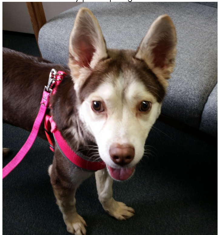
Sasha smiles at Jennifer Beauchamp on the first day she was able to go to her new and loving home.

If you do notice or suspect a lost, neglected or abandoned dog, or if your dog has gone missing, please contact the Public Works department immediately or leave a message on the animal control hotline at 360-458-8438. Please note: Currently, animal control only picks up dogs.